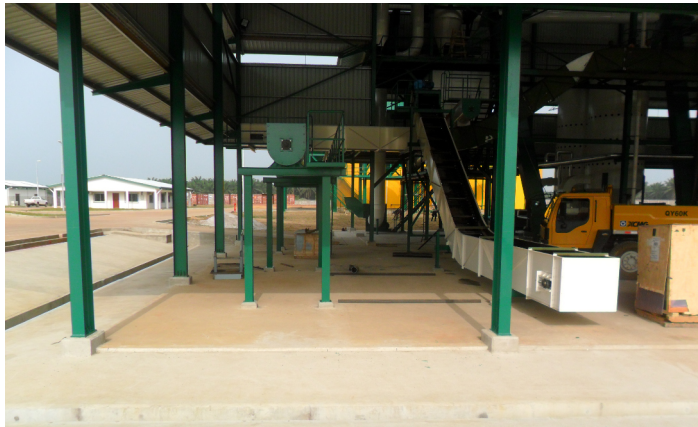
Fiber and boiler feeding station.