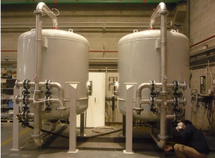
Water softeners for water treatment station. (Nalco)