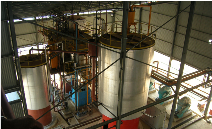
Pure oil storage and decantation station.

Project B: Housing and facilities for 1,000 people.