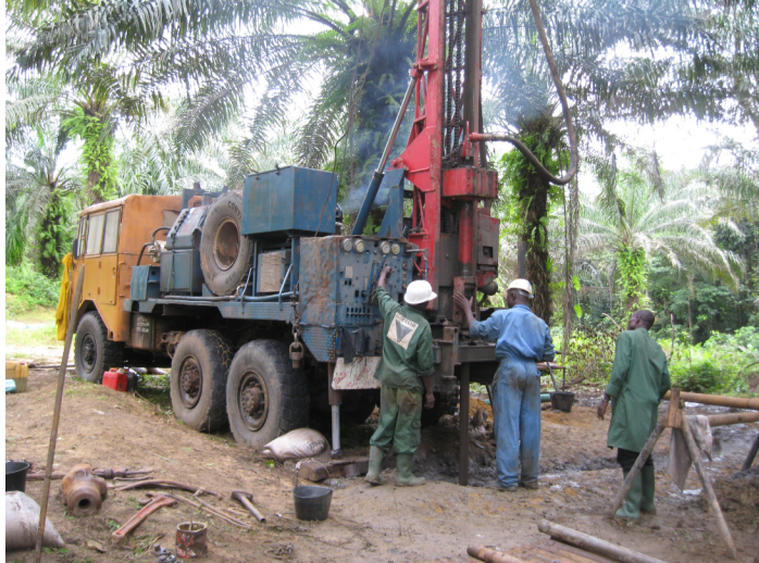
Drilling of several boreholes for water provision for the villages.