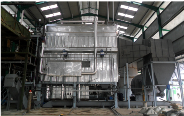
Installation of a Atmind 20T/Hr boiler on biomass.