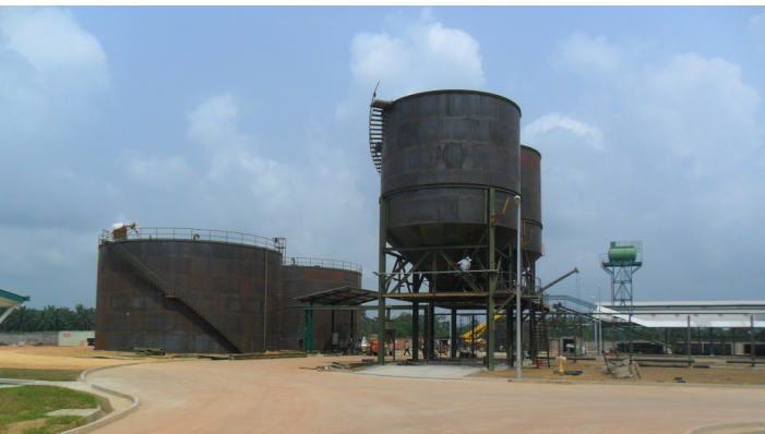
Welding of 2 x 2000T oil tanks, 2 x 300T Kernel silo and 10m 3 watertower.