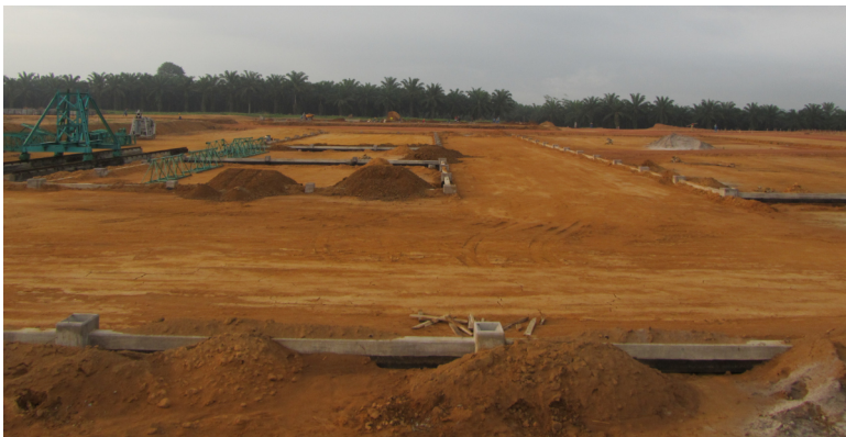
Building foundations for prefabstructure and groundworks.